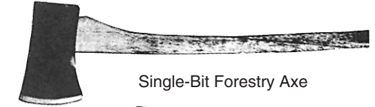
Single-Bit Forestry Axe