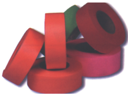
Tundra Flagging Tape