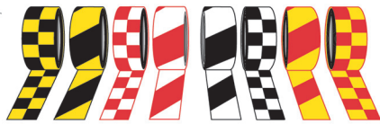
Warning Stripe Tape